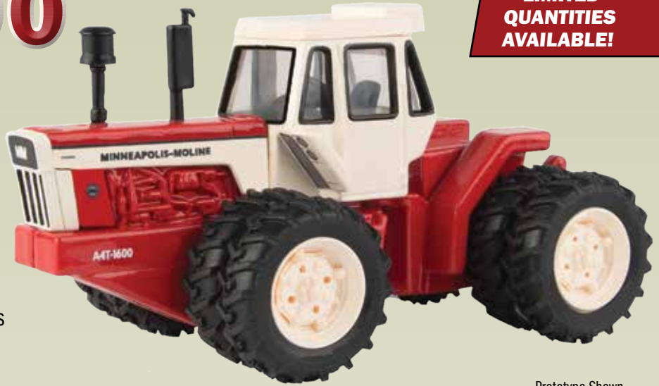
Prototype Shown Dimensions: 4" Long x 2 1/8" Wide x 1 7/8" High